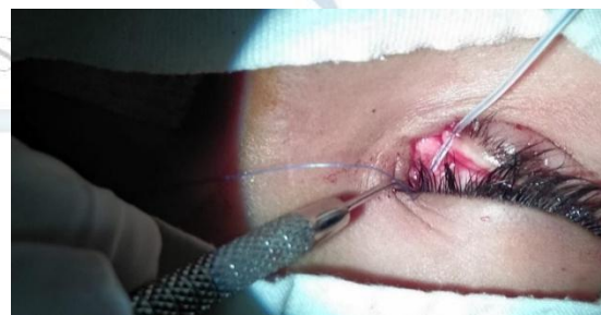
Figure-6: Repair with Bodkin Tube