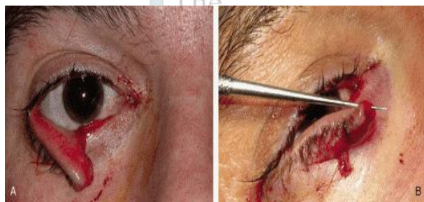
Figure-5: Lower canalicuar injury

The main outcome was the rate of success of canalicular repair, defined as restoration of sufficient tear drainage without excessive epiphora with good lid position. Secondary outcome parameters were complication rate, and factors affecting prognosis, i.e. the timing of the intervention and type of surgical technique used. The statistical software package SPSS 23.0 was used to analyze data. Descriptive statistics were used to characterize patient demographics, including age and sex, and nature of injury. Success rates of canalicular repair were determined and relationships between patient characteristics, surgical technique, and outcome were examined using suitable statistical tests which included chi-square tests and logistic regression analysis. Statistical significance was defined as p \leq 0.05 .